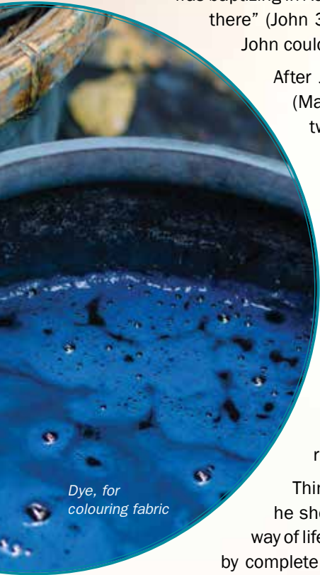
Dye, for colouring fabric